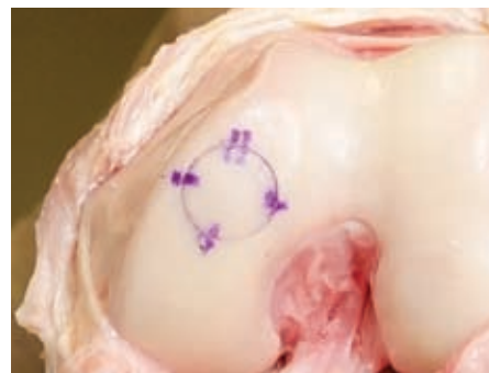
Oriented plug, advanced into recipient using press fit.

The images below compare the cell viability of an osteochondral graft with that of a patient's own knee cartilage.