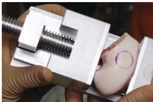
Secured allograft in vise, in same orientation as patient's exposed condyle.