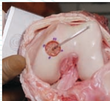
Post-identification defect, drilled Steinmann pin and advanced flat blade drill into condyle.